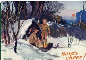
Cards – especially those done by B-P, above view from NZ