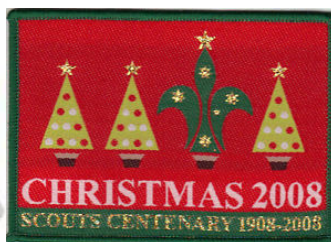
Yes, even patches-Australia