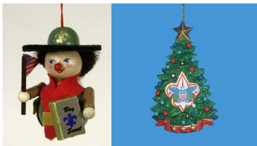
All sorts of Ornaments