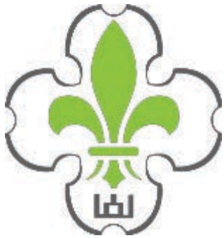
Lietuvos skautija Membership Badge