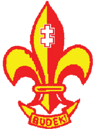
Historic Membership Badge