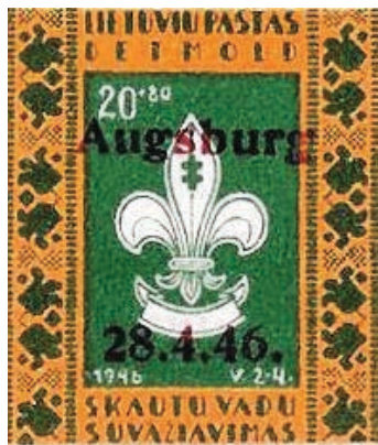
Stamp of Lithuanian Scout postal system for displaced persons camp