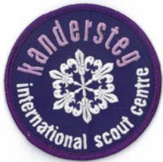
Kandersteg, - Swiss