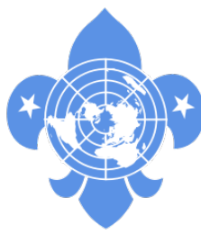
BS of the UN