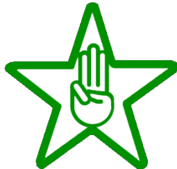
Skolta Esperanto Ligo