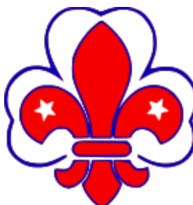
International Scout & Guide Fellowship