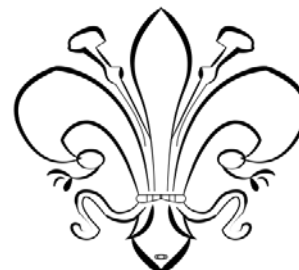
Order of World Scouts