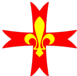
Int'l Union of Guides & Scouts of Europe