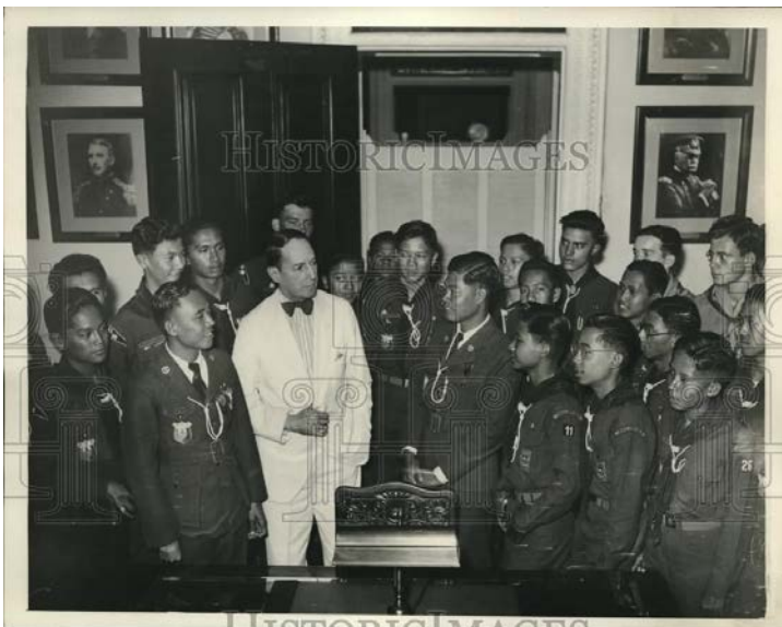
Interesting historical picture: Gen Douglas MacArthur after WWII with Philippine Boy Scouts

This is the largest and most prominent values-based youth organization in Uganda and provides a program that builds character, trains youth in the responsibilities of participating citizenship, and develops personal fitness. For over a century, the Association has helped build the future leaders of this country by combining educational activities and lifelong values with fun.