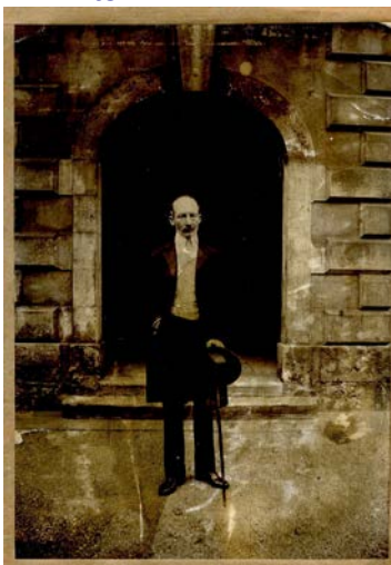
B-P at Charterhouse 1901

B-P was very fortunate to be accepted on a scholarship to Charterhouse. He joined the choir and remained a member for all of his six years. B-P also joined the orchestra, the school's brass band, and the cadet corps as a bugler. The Charterhouse school offered many extracurricular activities, and Baden-Powell became more and more involved in them. Aside from music, B-P became involved in sports, particularly soccer. In addition, he began to excel in rifle marksmanship. In the first inter-school rifle shooting competition that Charterhouse participated in, B-P scored the only bull's-eye in the whole competition. Finally, drama and theatrics were activities that B-P became very involved in, and he was a very talented actor and ad-lib performer. Among his peers, he was generally popular in the school. Two years after he had joined the school, they changed locations; it was a rough period and there was a lot of confusion. B-P's lively and understanding personality helped things to run a little smoother among the students.