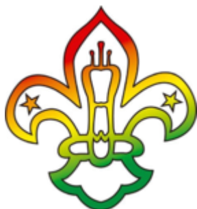
Asociación de Scouts de Bolivia

The Asociación de Scouts de Bolivia (ASB) was founded in Bolivia in 1911 and became a member of the World Organization of the Scout Movement in 1950. ASB has 7,898 members as of 2011. Guiding was introduced to Bolivia in 1915. Founded in 1958, the girls-only organization became an associate member of the World Association of Girl Guides and Girl Scouts in 1966 and a full member in 1978.