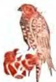
BAHRAIN Historic membership badge

The Boy Scouts of Bahrain (جمعية كشافة البحرين) was founded in 1953, and became a member of the World Organization of the Scout Movement in 1970. The Boy Scouts of Bahrain has 2,301 members as of 2011.