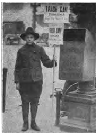
Boy Scouts Help to Keep Their Cities Clean

Every Boy Scout is pledged to do a good turn daily. The Good Turn is not the performance of a regular duty or task. It goes without saying that a Scout performs these faithfully and well, just because he is a Scout. But the Good Turn is something more, an extra, voluntary act of helpfulness or kindness which comes his way to do or which he goes out, knightlike, to seek. No Scout may take a tip for service rendered. Good Turn service is its own payment.