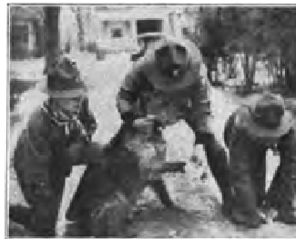
Boy Scouts Are Kind to Dumb Animals

The Scout is bound by his oath to be "helpful to all people at all times." Little by little, the Good Turn habit becomes ingrained in his daily