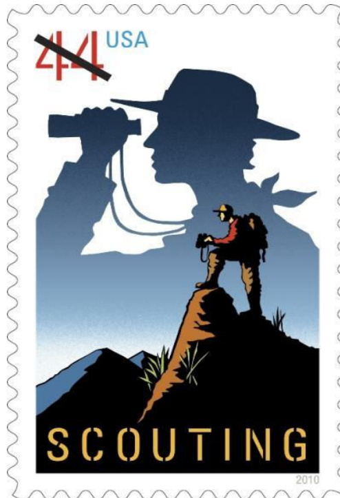
BSA Centennial Scouting Stamp