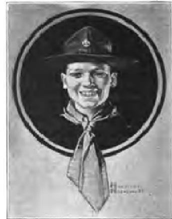
The Boy Scout of America

Why should we let Boy Scouts have the monopoly of the Good Turn? Why shouldn't we all have a try at it? What if you, and you, and you should pledge yourself to the daily Good Turn for one week, at least, and see what it would feel like? What if everybody in the town, every man, woman and child, decided to do the same thing and eventually set to work embedding the Good Turn as a regular feature of community life? As a community and as individuals, we would come out healthier, happier, richer in every way for the experiment.