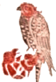
BAHRAIN Historic membership badge

The Boy Scouts of Bahrain (جمعية كشافة البحرين) was founded in 1953, and became a member of the World Organization of the Scout Movement in 1970. The Boy Scouts of Bahrain has 2,301 members as of 2011.