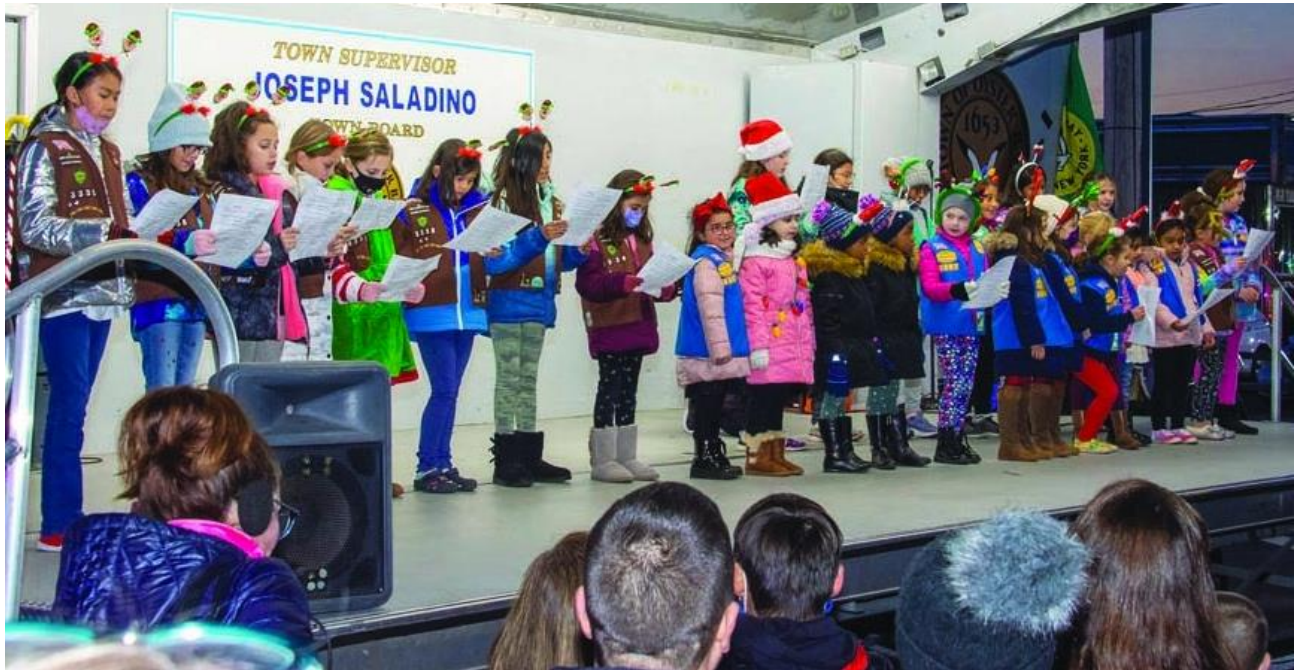
Hicksville-Jericho Rotary's Holiday Tree Lighting featured caroling by Hicksville Girls Scouts, flag ceremony by Cub Pack 381, and decorations by Daisies & Brownies Troop 3396 and Cub Pack 381.