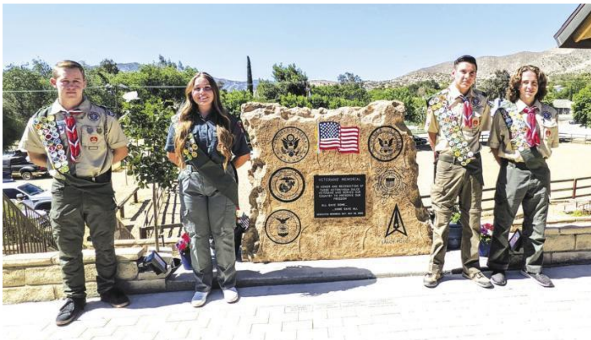
Antelope Valley Rotary Club provided the land for 4 Eagle Scout candidates from Troop 145 and Crew 145 combined to create a veterans memorial with a flag box for their Eagle projects.

Antelope Valley (CA) Rotary Club, May 31, 2022, Antelope Valley Press , (award)