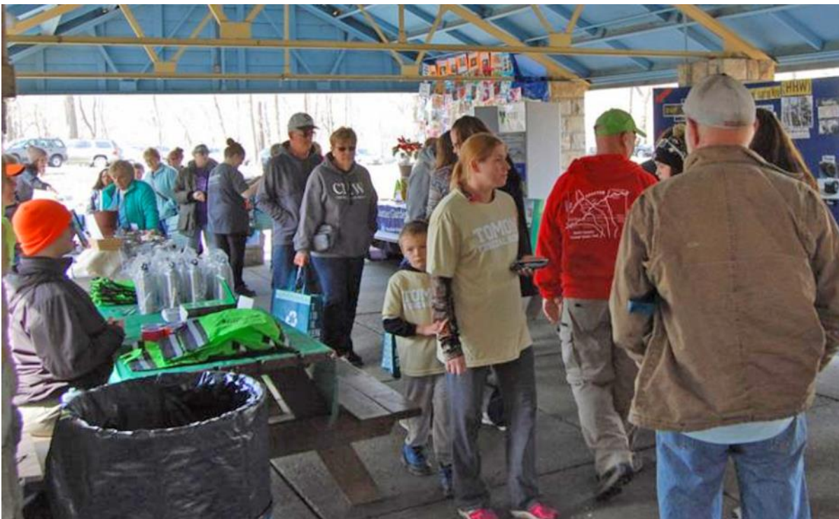
Ellwood City Rotary Club and Boy Scout Troop 806 joined forces to lead an Earth Day Community Clean-up after participating in the annual Lawrence County Earth Day Celebration.