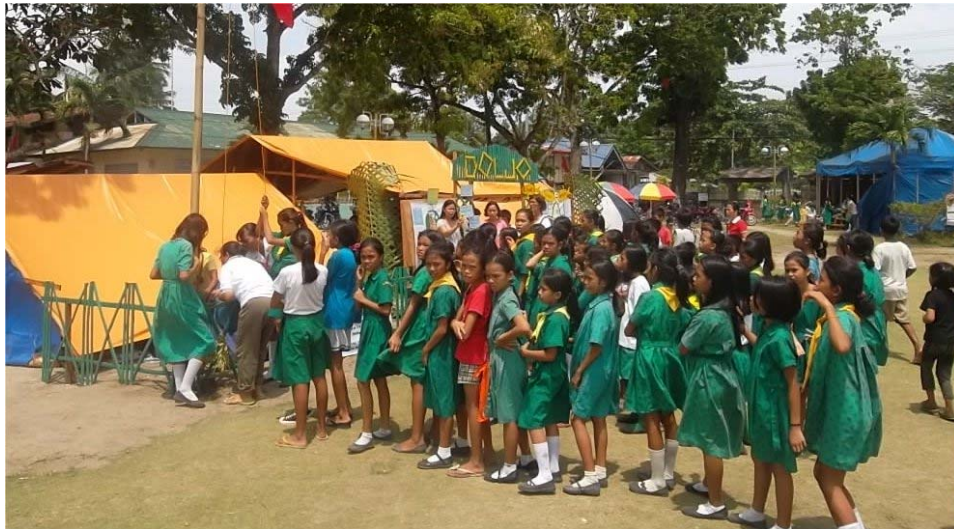
Girl Scouts at Panglao Island

Editor's Note: This is a short report of some amazing work being done by Rotary and Scouting in the Philippines with extraordinary support from Australia. Exemplary work like this should be an inspiration to us all over the world.