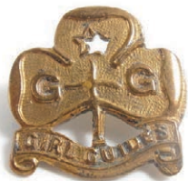
UK Brownie Australia