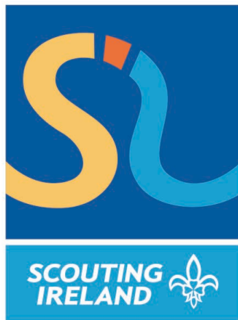
The logo of Scouting Ireland