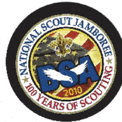
BSA NJ 2010