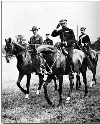
1911 with King George