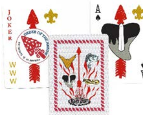
OA Lodge 470