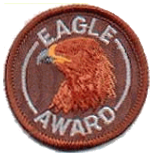
Eagle Award badge

Scouting in the former Rhodesia and Nyasaland started in 1909 when the first Boy Scout troop was registered. It shares history with Zimbabwe and Malaŵi, with which it was linked for decades. The great popularity of the Boy Scout movement was due to its outdoor program such as hiking, camping, cooking and pioneering, which was unusual in the protectorate. Additionally, the training and progressive badge system was targeted towards helping others, leading to responsible citizenship.