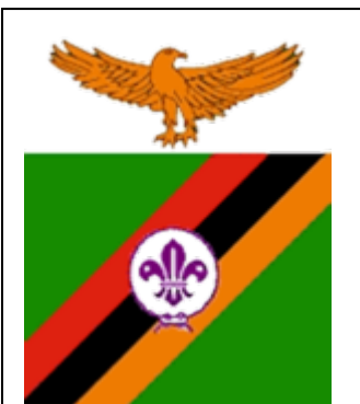
Zambia Scouts Association