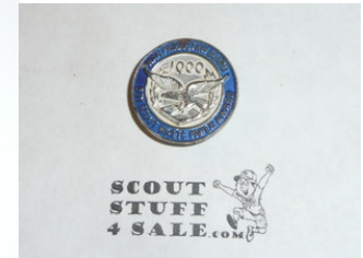
1000 lbs of waste paper