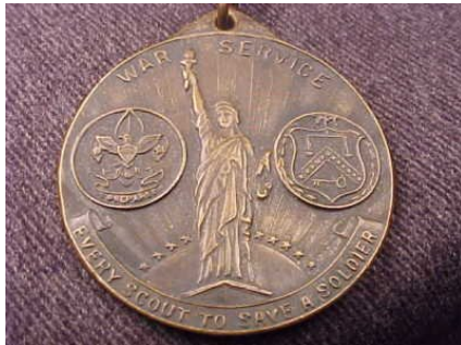
War Bonds Treasury Award