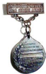
US Treasury Award