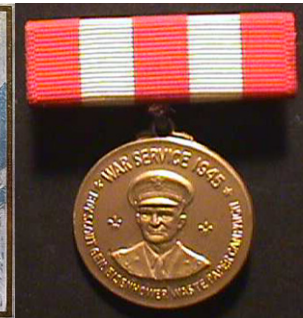
Eisenhower Waste Paper