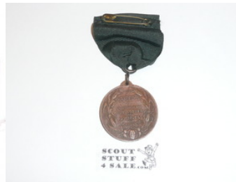
WWI Gardening Medal