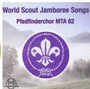
CD of WJ Songs