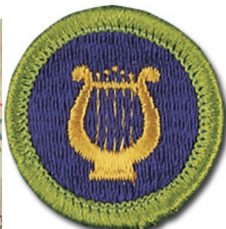
BSA Merit Badge