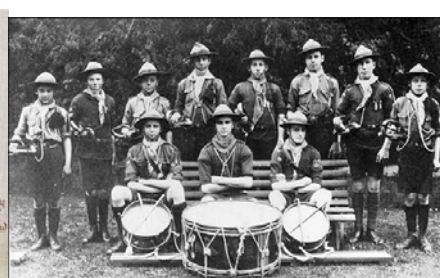
Rushden UK Scout Band Photo

24th WORLD SCOUT JAMBOREE GUIDELINES FOR REGISTRATION: Guidelines for a World Scout Jamboree are that no contingent is allotted more than 10 percent of the expected attendance. As the host, the BSA cannot represent more than 20 percent of the total attendance at the jamboree. We are awaiting the allocation from the 2019 WSJ Host Team for the number of people, considering our collaboration with Scouts Canada and Scouts Mexico, for the BSA contingent. We expect the interest to be greater than our allocation. The allocations to youth will be our highest priority. The Host Team is a separate department from the International Department at national. The team is led by Executive Director Marty Walsh. Be sure to indicate your interest by signing up on the BSA contingent website at www.scouting.org/worldjamboree . For more information about the 2019 WSJ Host Team, see www.2019wsj.org .