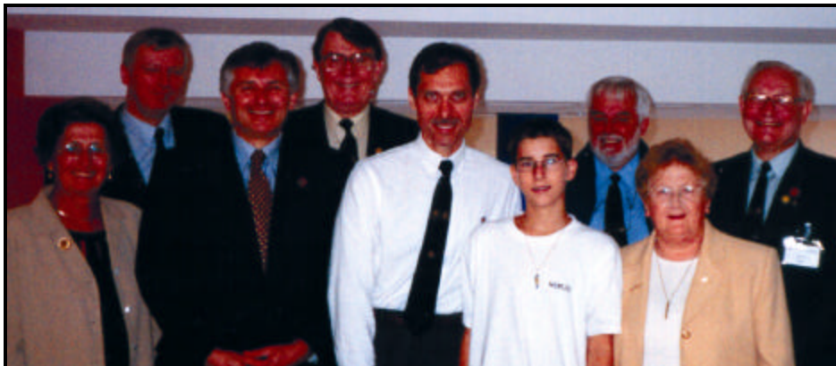
PHOTO: Scouting Rotarians and family members at Lord Baden-Powell's House in London.

Just released last September the new booklet suggests a step-by-step project approach as a way to motivate youth to plan achievable goals and then carry out the plan. You can download the document from this website: www.scout.org/wso/publications.html