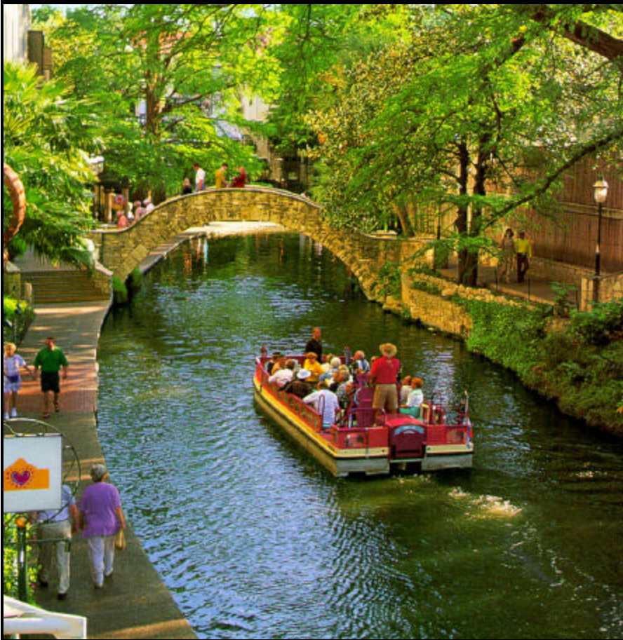
PHOTO: San Antonio's river walk captures the attention of most visitors. Restaurants and gift shops line the banks of the river as a small sight-seeing boat circles the historic downtown area. Events on both Saturday and Monday evenings will bring most Rotarians to this popular part of the city and many of the convention hotels are on the river.