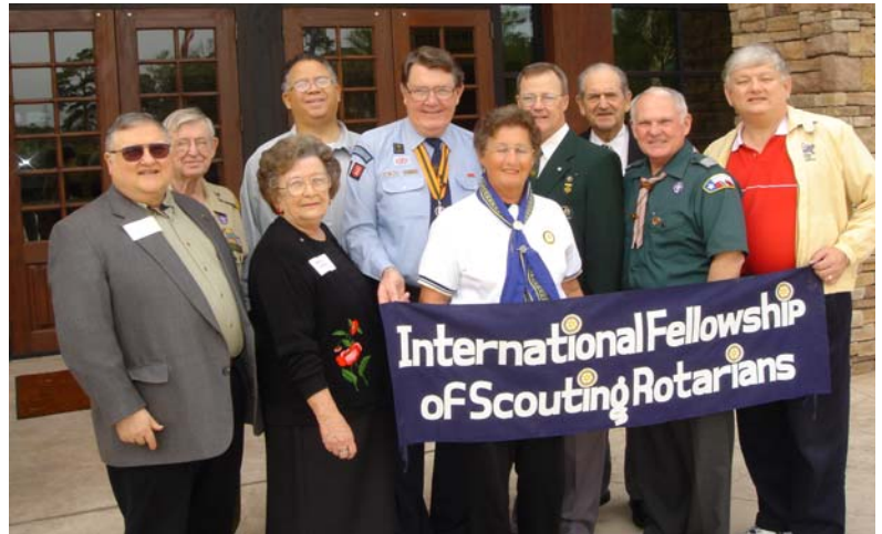
Group Photo of Attendees

The group was invited to have lunch with the Houston council's Wood Badge training troops and leaders preparing for the up-coming Wood Badge Courses (3) to be held in the Sam Houston Area Council during the next few months.