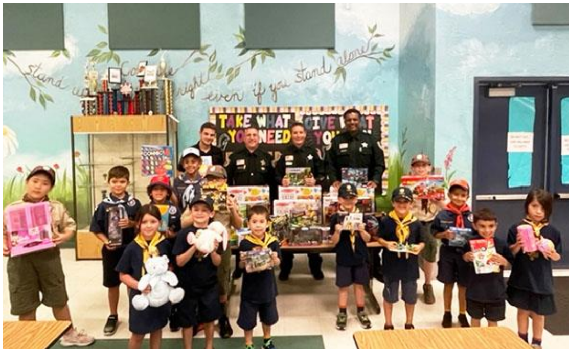
Wellington Rotary Club's Cub Scout Pack 125 organized two Charitable Initiatives, Scouting for Food (collecting 546 pounds) and Toys for Tots (shown above) to help those in need.