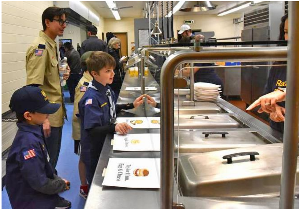
Westfield Rotary Club's annual Breakfast with the Bands was assisted in cleanup efforts by several Westfield Boy and Girl Scout Troops.