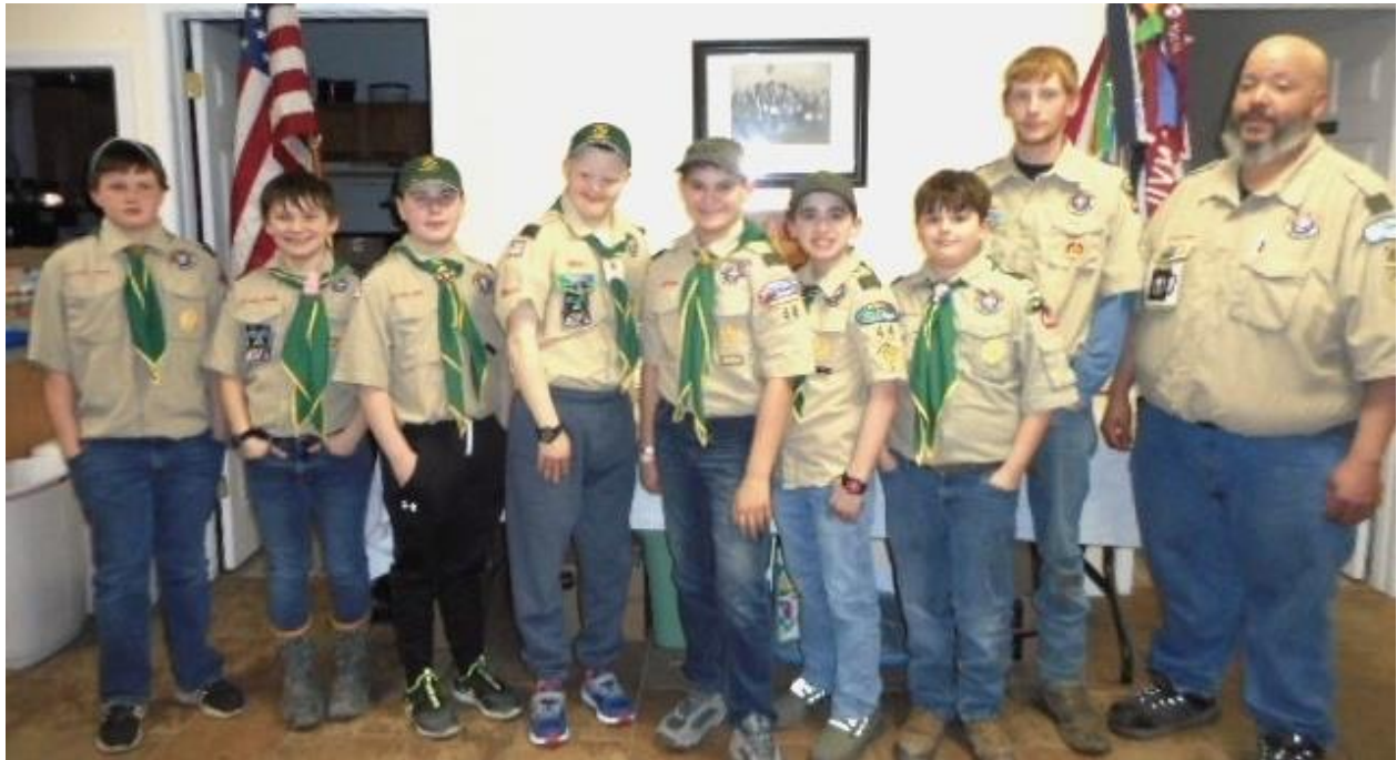
Granville Rotary Club sponsors BSA Troop 44. The troop recently held a Court of Honor for six of its Scouts who earned the Tenderfoot rank.