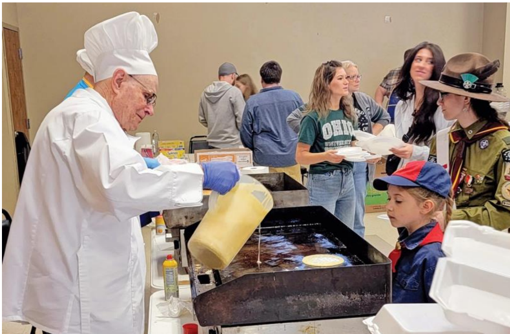
Ironton Rotary Club was assisted by Boy Scout Troop 106 at their annual breakfast. Scouts made sure people had drinks, cleaned up and put away tables at the end.