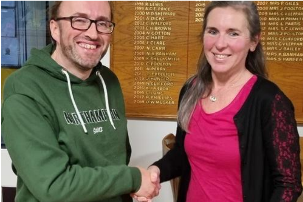
Danetre Daventry Rotary Club’s Santa Sleigh tour raised £20,000 for charity with help of the Ashby Fields Scout Group and 29 other organizations.