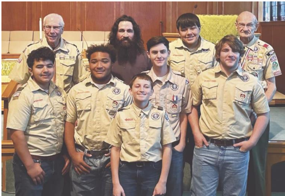
El Campo Rotary Club & First Methodist Church Charter BSA Troop 368. The Troop attended Scout Sunday services at the First Methodist Church.