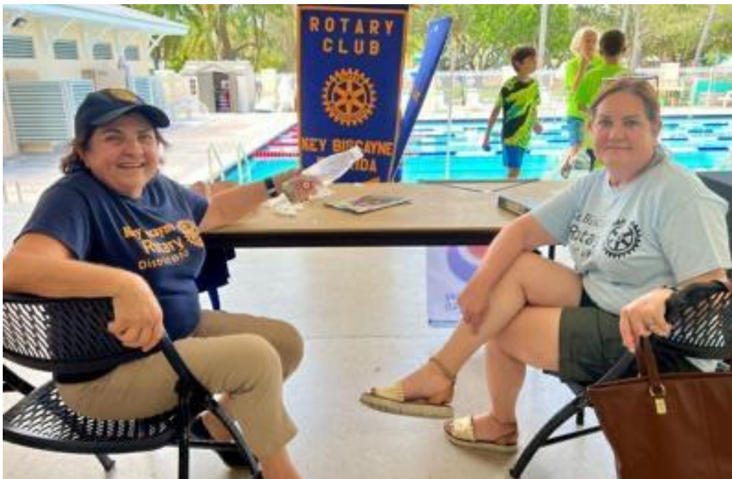
Key Biscayne Rotary Club worked the Cub Scouts Pack 149 recruitment pool party and set up a table with engaging and educational activities for children.