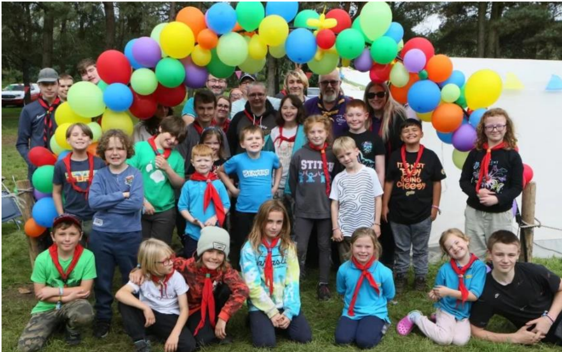
Hucknall and Linby Rotary Club members visited the Ashfield Scout Weekend campers and made a donation to support the weekend's activities.