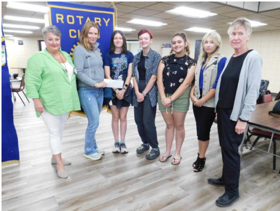
St. Clairsville Rotary Club presented donations to Girl Scout Troop 1002 and other area organizations. The Girls Scouts created hygiene closets in the middle and high schools.