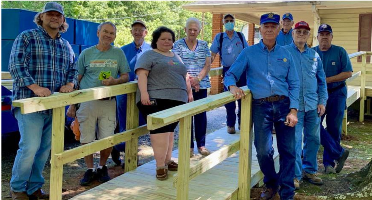
Madison County Rotary Club of aided Boy Scout Camp Rainey Mountain in Clayton Georgia make their rifle range handicap accessible for disabled Scouts attending gun safety instruction.