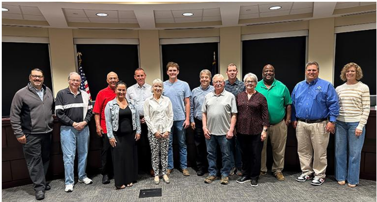
Somerset-Pulaski County Morning Rotary awards a scholarship to the person Summerset Community College selects based on their involvement in Boy Scouts and financial need.