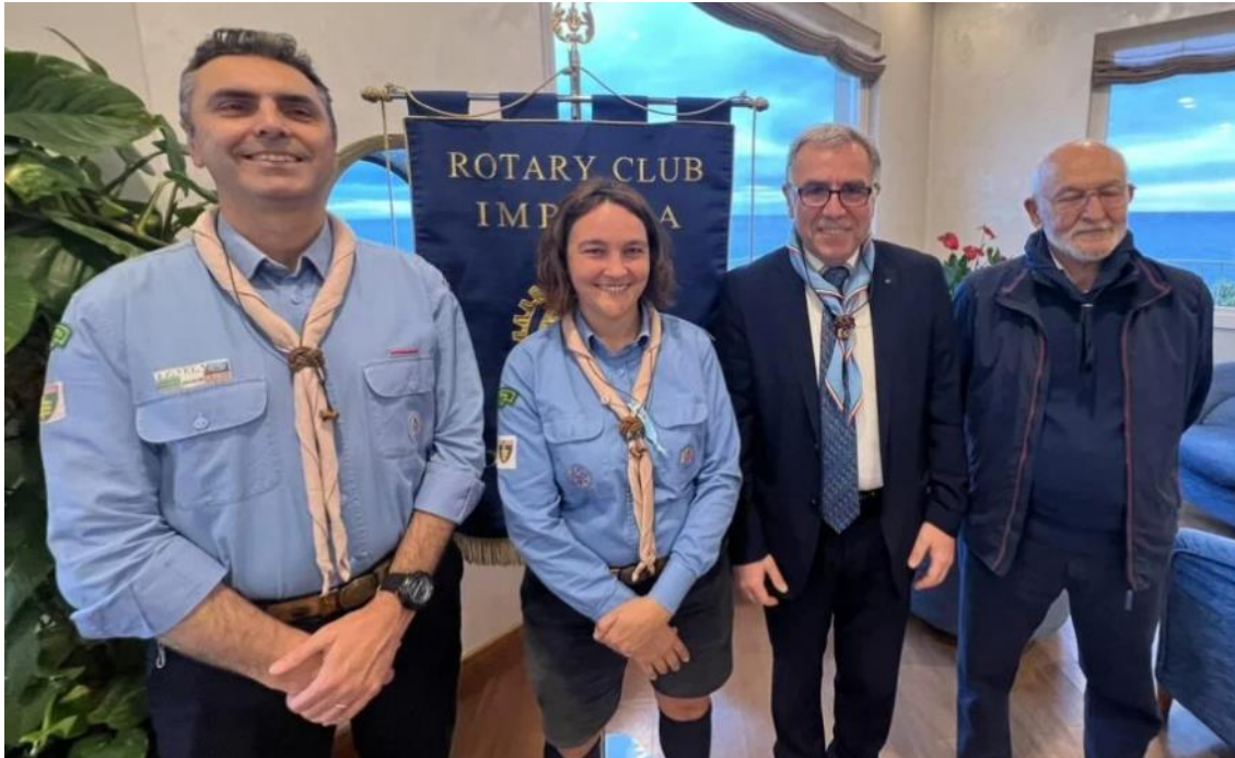
Imperia Rotary Club dedicated an evening to the world of scouting. IFSR members work together with the Rotary Club and Scouting to promote cooperation.