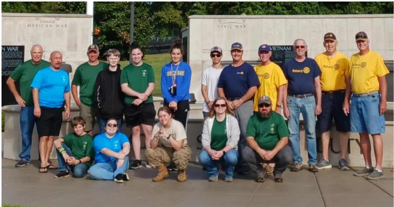
The Huntsville Madison County Veteran's Memorial Foundation dedicated a plaque honoring the Rotary Club of Greater Huntsville, Scouts BSA Troop 94 and 95 for their dedicated service