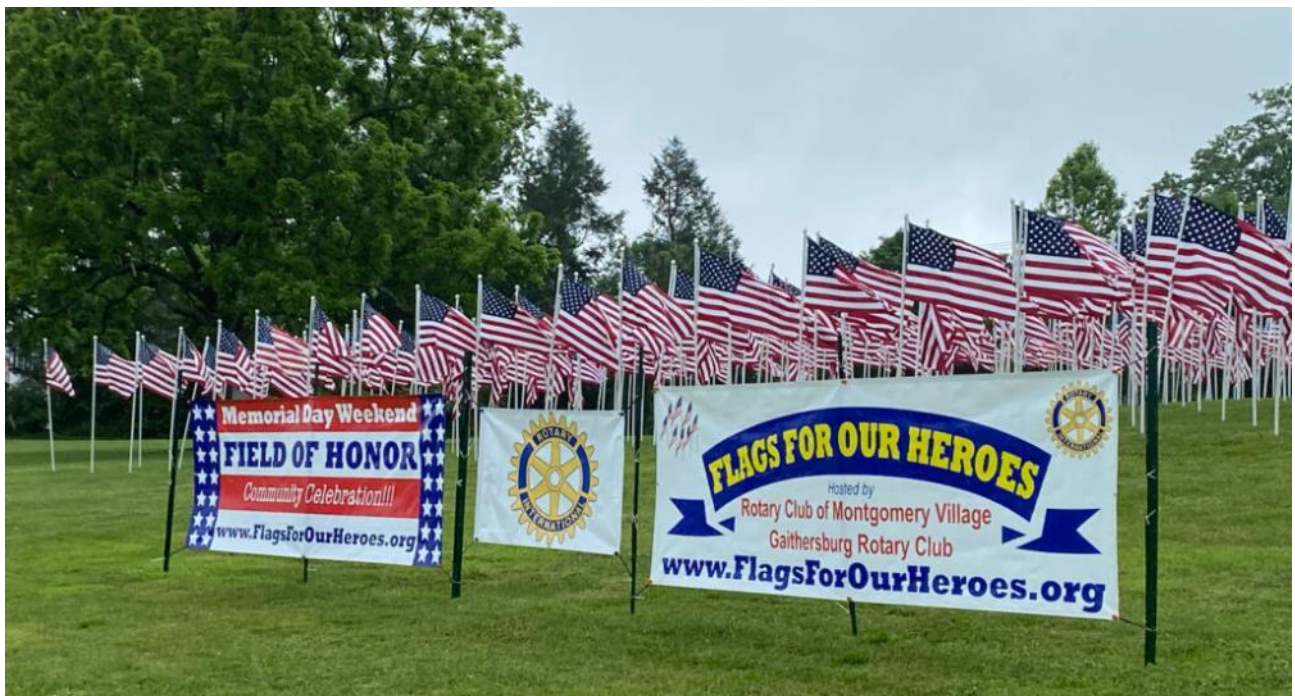
Gaithersburg & Montgomery Village Rotary Clubs placed 750 Flags For Our Heroes In Bohrer Park. Scout guarded the flags at night and conducted a flag retirement ceremony on Memorial Day.