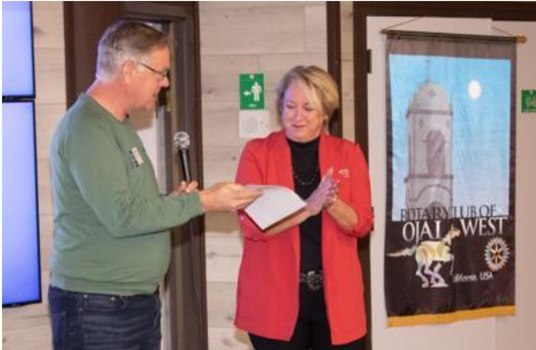
Ojai West Rotary Club awarded a $20,000 grant to the Girl Scouts of California's Central Coast's Camp Arnaz to rebuild the bathroom facilities that were damaged by recent storms.