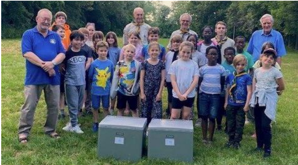
Spalding and Welland Rotary Club donated 2 refrigerators to the Spalding Scout Group from South Holland for the group to use on their regular outings.