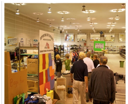
Rotarians distributing donations