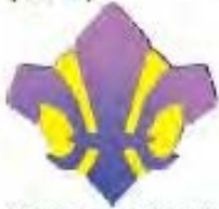
Movimiento Scout Catolico (MSC)