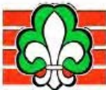
Catalan Federation of