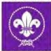
Federation of Spanish Scout Association (ASDE)