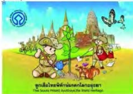
มูลนิธิเพื่อพัฒนาประเทศไทย The Scouts Project Ayutthaya, the World Heritage

The Federació Catalana d'Escoltisme i Guiatge (FCEG, Catalan Federation of Scouting and Guiding ) is the federation of three Scout and Guide associations in Catalonia.