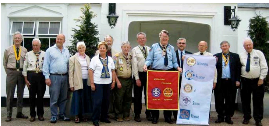
Some of AGM group outside The White House