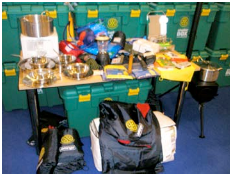
Contents of a SHELTERBOX

IFSRinRIBI is a section within IFSR WORLDWIDE with around 1000 members in over 30 countries